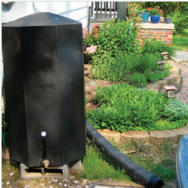
Rain barrel provided to residents as part of the RiverSmart Homes program.