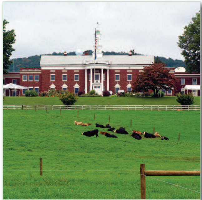
Cattle rest in a paddock of the rotational grazing system installed on the Lycoming County Farm.