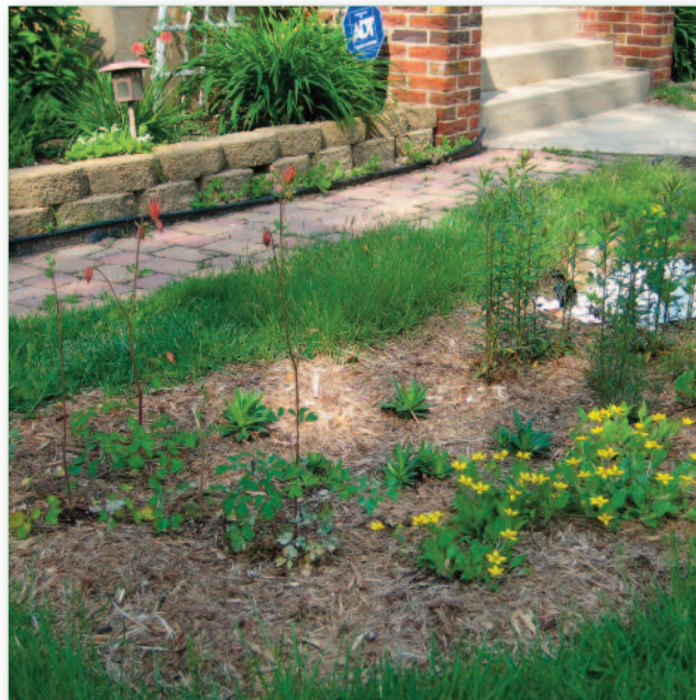
Washington, D.C. rain garden.

With a half-inch of rain, Washington, D.C. faces a problem: Its combined sewage treatment system, which serves one-third of the city, begins to overflow, sending raw sewage and trash from the city's streets into the Anacostia River.